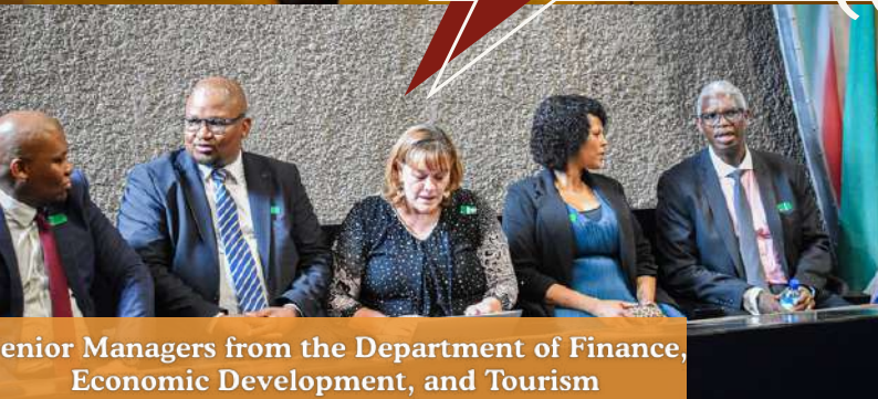
Senior Managers from the Department of Finance, Economic Development, and Tourism