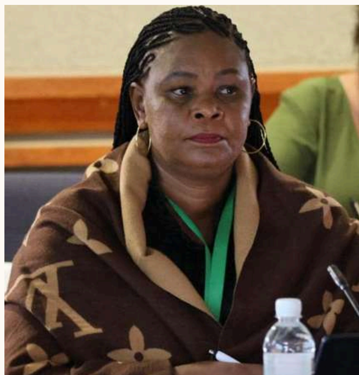
Speaker Newrene Klaaste is all ears and laser-focused during presentations on the study tour in Namibia, soaking up insights on lawmaking, legislative oversight, and public participation.

Cultural Visit The delegation, accompanied by Members of the Council of Namibia and protocol officers, visited the Independence Memorial Museum in Windhoek, Namibia. This historic museum showcased the country's journey to independence, highlighting the anti-colonial resistance which resulted in the ultimate national liberation of the people of Namibia.