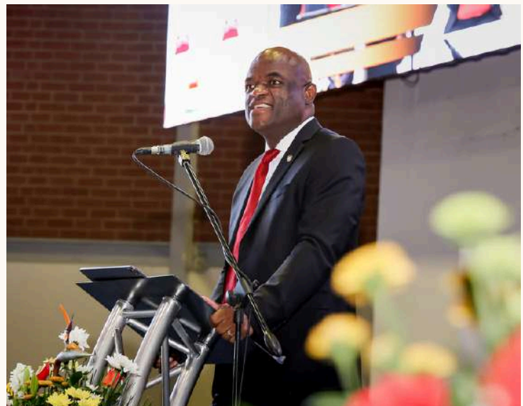
Premier Zamani Saul's 2025 State of the Province Address outlined Northern Cape's path to economic recovery, infrastructure growth, and better governance, emphasizing job creation and inclusive economy.

Infrastructure featured prominently in the address, with over 100 reported projects currently being implemented under the Infrastructure Strategic Projects Pipeline. These include upgrades to roads, public facilities and bulk services . The projects aim to improve service delivery while laying the groundwork for sustained investment and growth.